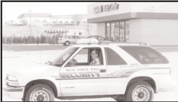
Private security patrols around large shopping malls help reduce burglaries to retail establishments located in and around the malls.

10. Employing security guards after hours. Burglars say that security guards pose the greatest threat to their activities. 32 Guards are widely employed in large malls and retail parks, which helps to account for the relatively low burglary rates of stores in these locations. An alternative adopted by some large stores is to employ a night crew that handles cleanup, restocking and display dressing. The store is protected from burglars while this necessary work gets done.