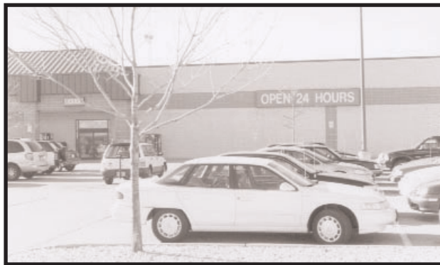
Stores that are open around the clock are protected from burglary by the constant presence of staff.