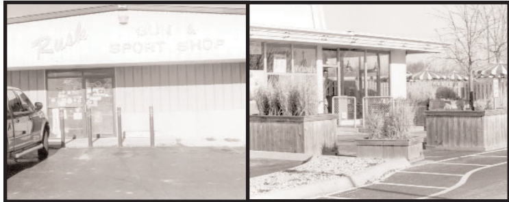
Installing pillars, posts or planters in front of store doors helps prevent burglars from driving vehicles through the doors.