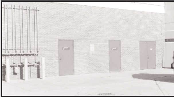
Site surveys of stores should include an assessment of the natural surveillance, lighting and security of the stores' rear entrances.